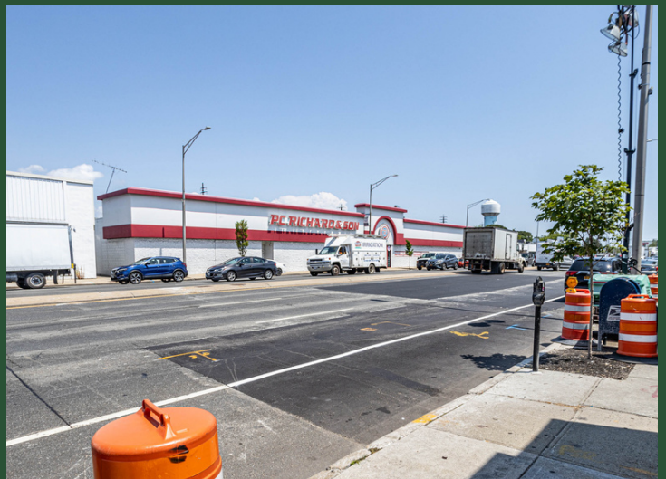
Roadway Restoration at Pit B (July 2023)