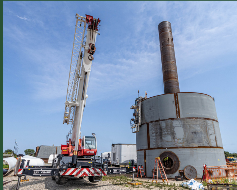
Construction of the Receiving Tank Structure (July 2023)