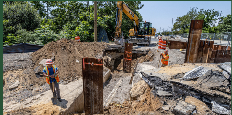
Sheet Pile Installation at Pit W (July 2023)