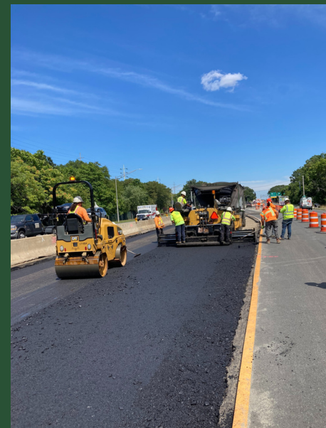
Paving at Pit W (August 2022)