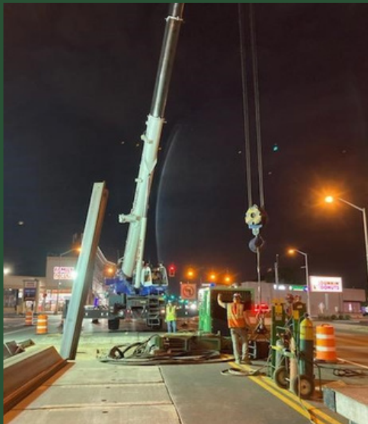
Sheet Pile Installation at Pit N (August 2022)