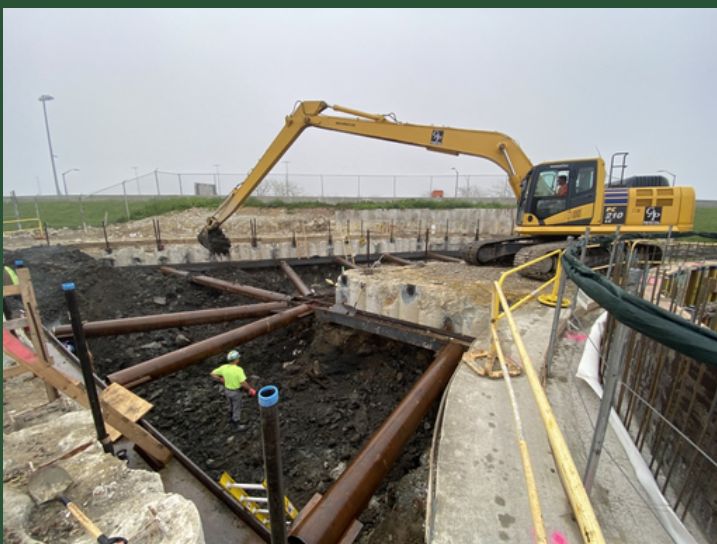
Diversion Structure at BP1 (June 2022)

In the immediate areas surrounding Bay Park shaft sites, residents will notice an increase in construction vehicles and crews. WBC will continue to monitor and control any potential noise, dust, vibrations, and settlement from construction activities. Unless otherwise specified, work activities are expected to occur between 6 a.m. – 5 p.m., Monday through Friday. Saturday work is expected in July. We will continue to update the public as more information becomes available.