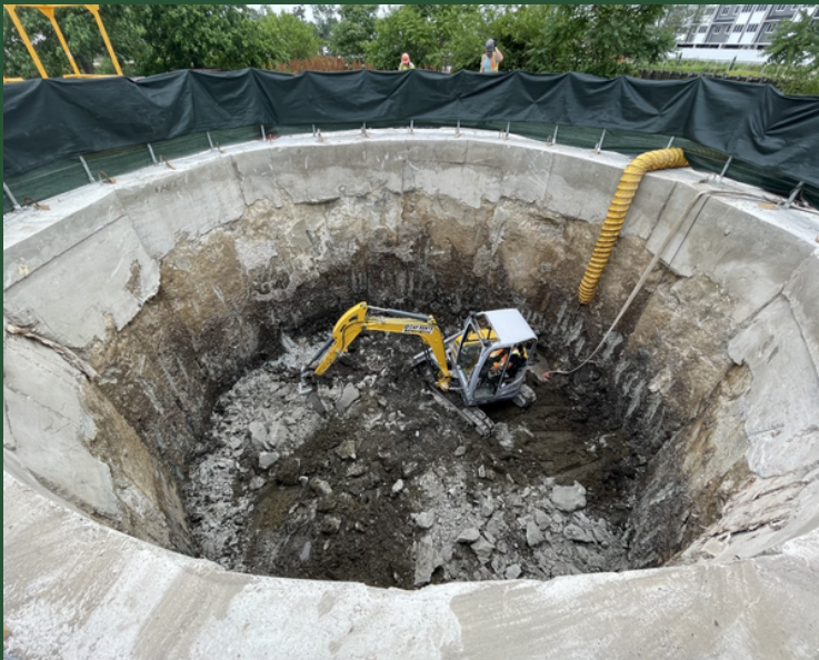
Excavation at BP5 (June 2022)