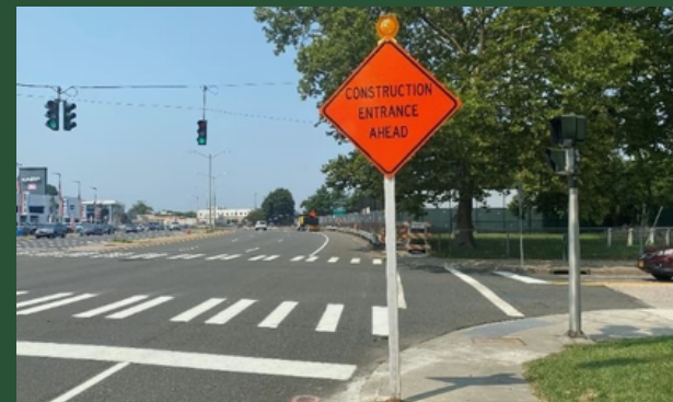
Example of Maintenance and Protection of Traffic (MPT) on Sunrise Highway (June 2022)