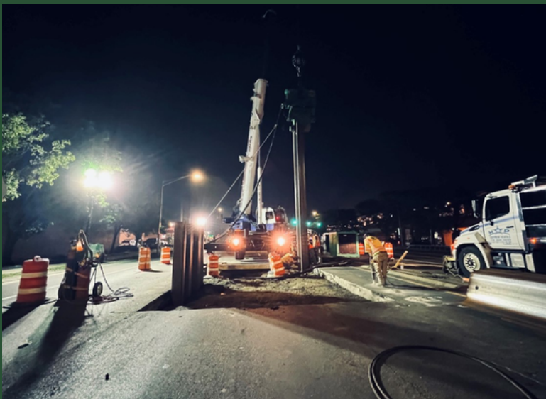
SOE Installation at Pit V (June 2022)