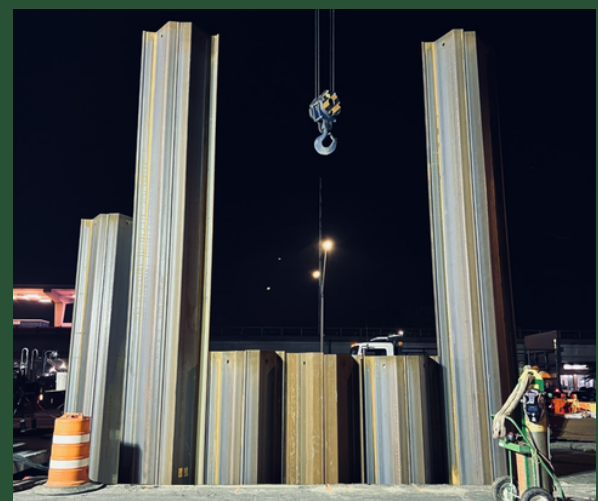
Sheet Pile Installation at Pit V (June 2022)