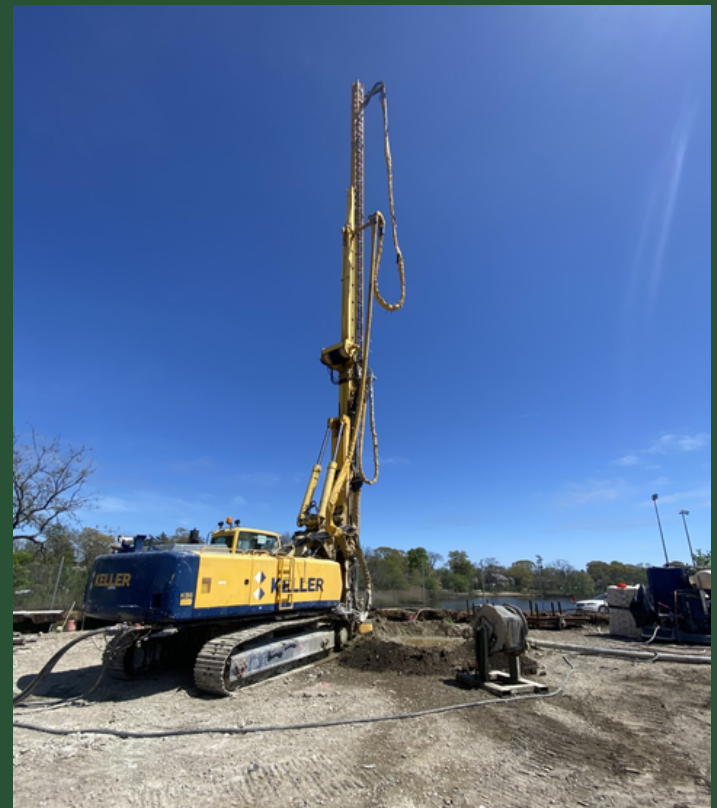
Jet Grout Operations at BP7 (May 2022)