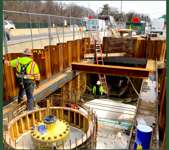
Construction Near Pit W (April 2023)