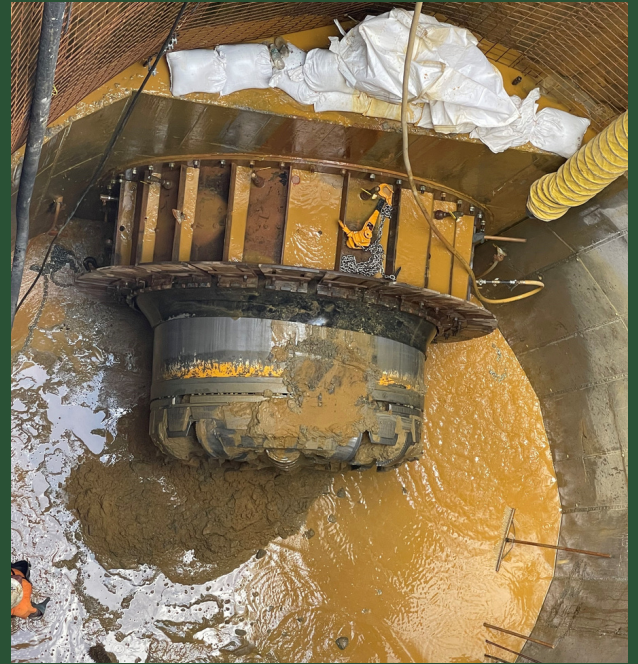
Breakthrough at Bay Park Shaft 7 (June 2023)