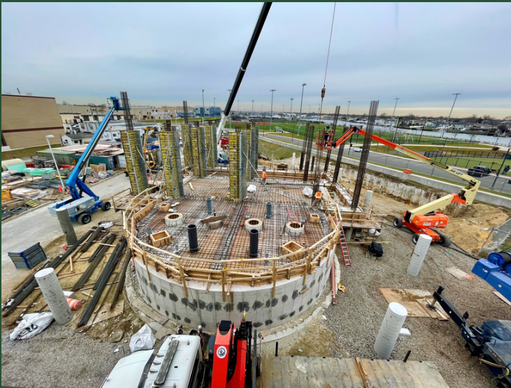
Pump Station Construction (January 2023)

In the immediate areas surrounding Bay Park shaft sites, residents will notice an increase in construction vehicles and crews. WBC will continue to monitor and control any potential noise, dust, vibrations, and settlement from construction activities. Unless otherwise specified, work activities are expected to occur between 6 a.m. – 5 p.m., Monday through Friday. Saturday work is not expected in February. We will continue to update the public as more information becomes available.