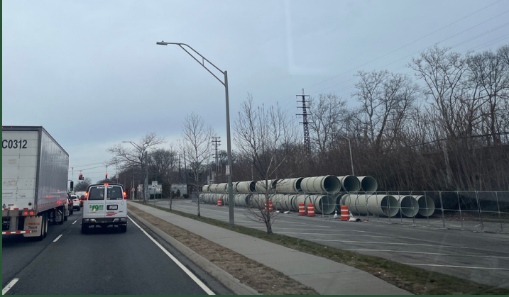
Pipe Storage on Sunrise Highway (January 2023)