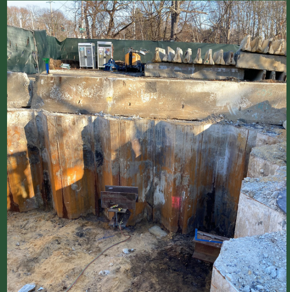
SOE Installation at CC6 (December 2022)