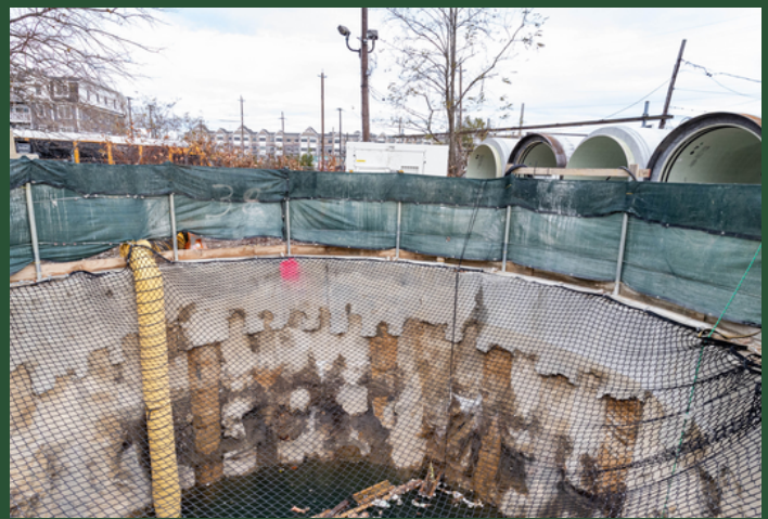
BP4 Shaft and Construction Site (November 2022)