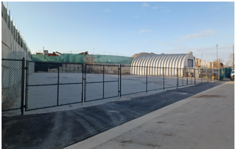
Bay Park Shaft 3 Restoration (March 2024)

Microtunneling is complete along the Bay Park alignment. However, residents may notice the following activities: • Final restoration activities are nearing completion at Bay Park Shafts 1 and 2, and is complete at Bay Park Shaft 3. Restoration activities continue at Bay Park Shaft 4. • Preparations are underway to install a steel pipe connection between Bay Park Shaft 9 and Pit A. • Hydrostatic testing between Bay Park Shafts 1 and 5 is underway. • Crews are working below the ground from Bay Park Shaft 7 to Bay Park Shaft 9.