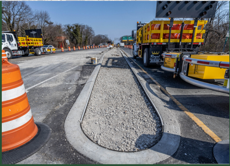
Roadway Restoration near Pit W in Wantagh (February 2024)