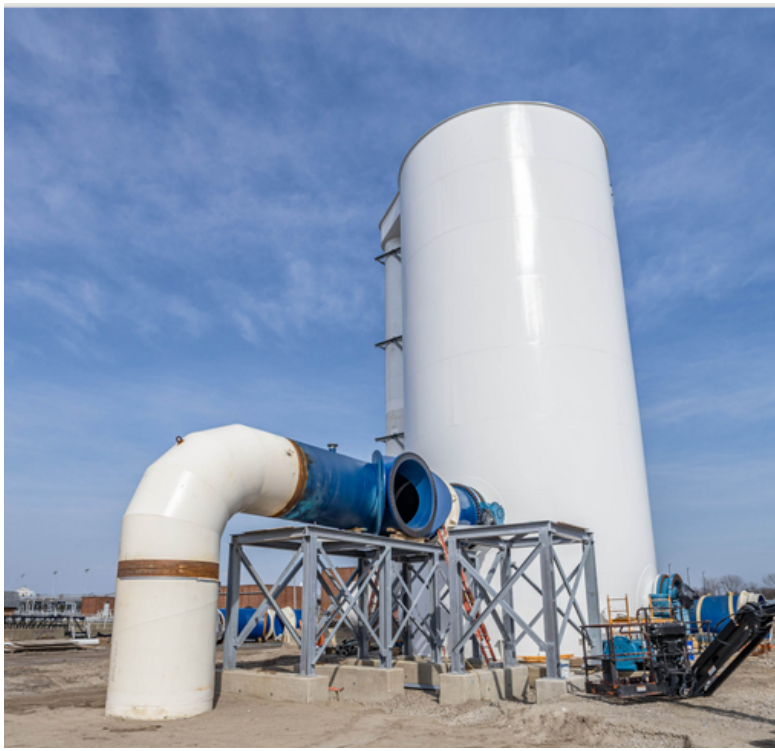
Receiving Tank Structure Progress at Cedar Creek WPCP (February 2024)

Microtunneling is complete along the Cedar Creek alignment. However, residents may notice the following activities: • In April, backfilling activities are planned at Cedar Creek Shafts 4 and 5. • Crews will construct a berm at Cedar Creek Shaft 5 and landscape restoration activities will commence at select shaft sites. • Crews are working below the ground in the pipeline, inspecting the pipe and testing joint connections. This work is performed in advance of the more rigorous hydrostatic testing. • Hydrostatic testing is underway at Cedar Creek Shafts 1 and 3. • Crews completed installation of a riser pipe at Cedar Creek Shaft 6 in preparation for hydrostatic testing.