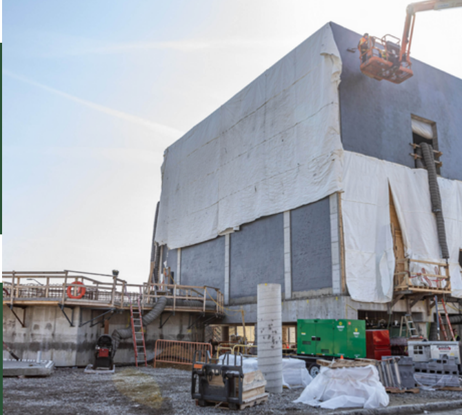
Exterior of the new Effluent Diversion Pump Station at SSWRF (February 2024)