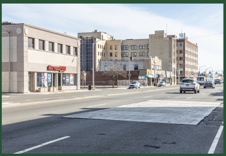
Pit B (February 2023)