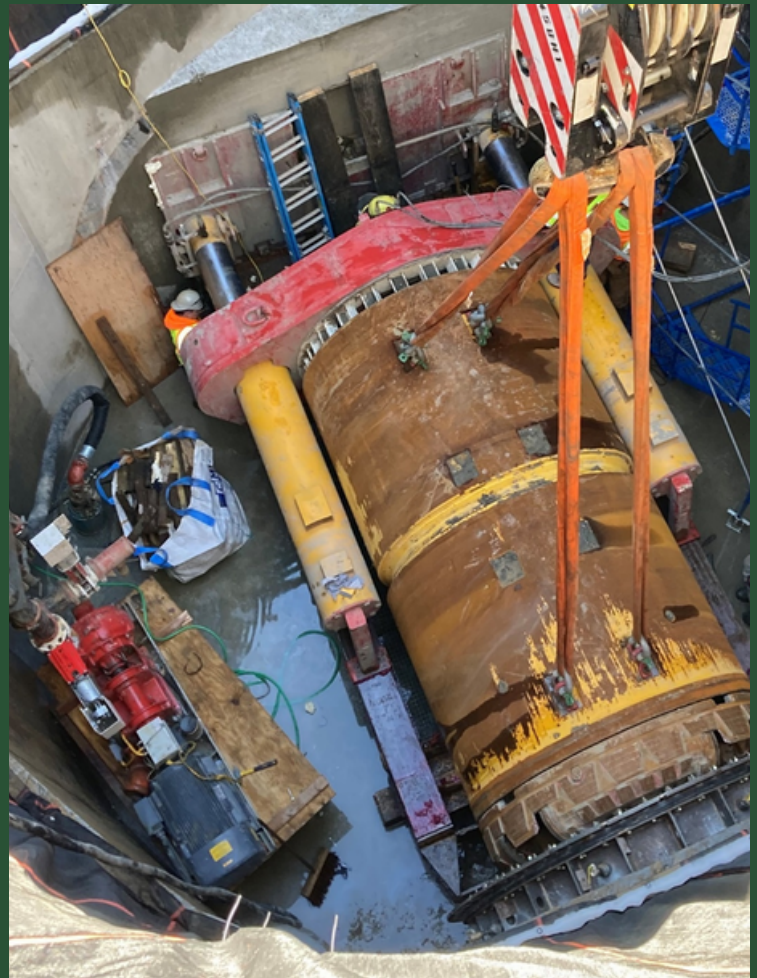
Commencing Microtunneling from CC5 to CC6 (March 2023)