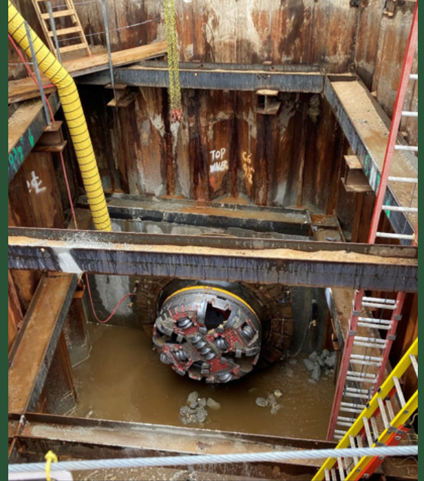
Breakthrough at CC6 (March 2023)